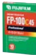
FP-100C(4 x 5inch)