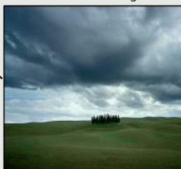
Cooling Level 2