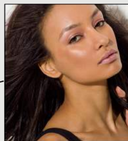
Warming Level 2