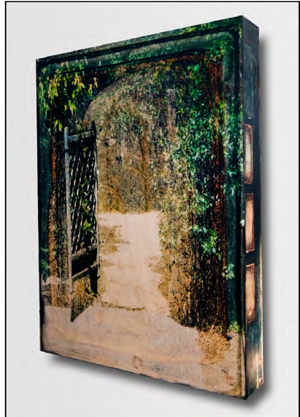
Gate 18" x 24" x 3" birch box