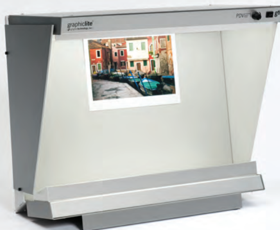
PDV e/Dx series