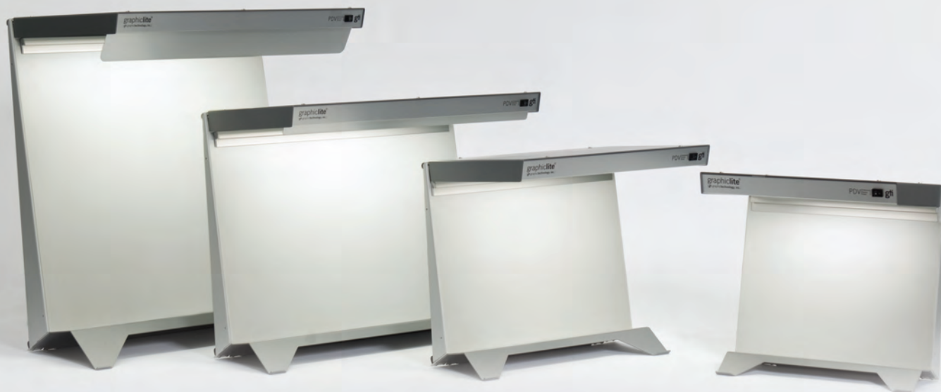
PDV e series