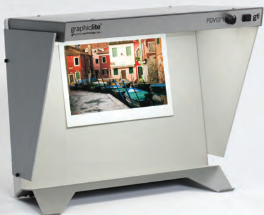
PDV e/D series with side walls