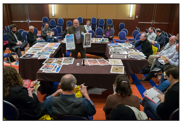
Society for Photographic Education National Conference